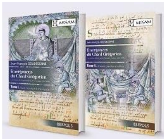
ISBN: 978-2-503-57978-8. Received in Soft cover (paperback) copy from the publisher. Two tomes (in French), 584 pages total (304 + 280), 98 b/w ill. + 6 colour ill., 216 x 280 mm, 2018. 6