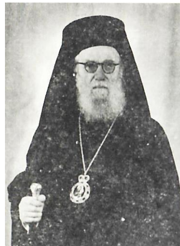
Bishop Irineos photographed in 1935. (From the booklet, p. 15.)